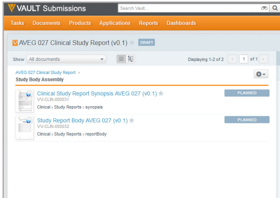
Figure 1: Configurable submission binders define what's needed so you know what's missing.

With Vault Submissions, there are no servers to buy or maintain, no software upgrade projects, and dramatically reduced system validation costs. And with scalable pricing, Vault Submissions is affordable for even the smallest organizations.