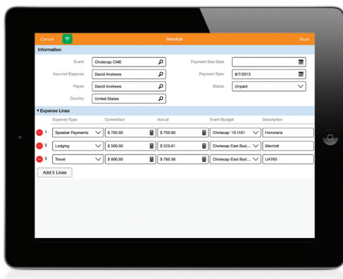
Invoice data entry

With many disparate systems in use across event types and geographies, however, it is nearly impossible to efficiently track speakers and spend. Poor KOL usage and limited spend visibility impact compliance and event success. Bringing the best speakers together with the right audience is challenging—and difficult to coordinate across stakeholders.