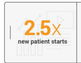
Promotional impact of digital content In-person and video meetings

WITH DIGITAL CONTENT VS. WITHOUT