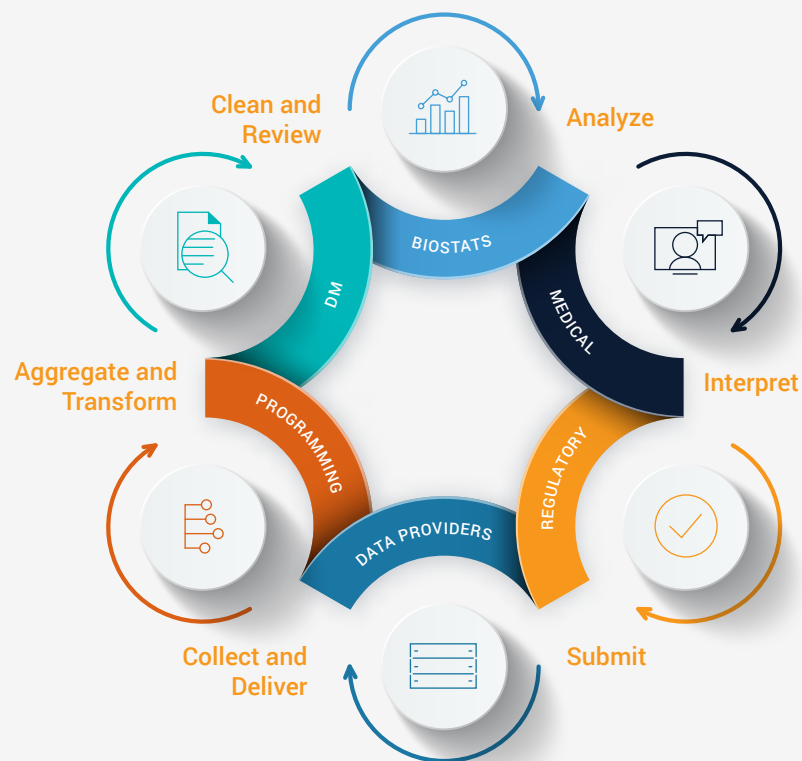
FIGURE 1 Desired Collaboration Using a Clinical Data Workbench

Today, when external patient data predominates, reliance on the wrong tool creates risk and vulnerability. For example, a statistical computing environment may aggregate and transform data well, but won't enable data cleaning; a clinical data repository may aggregate but cannot transform, while a visualization application won't handle aggregation effectively.