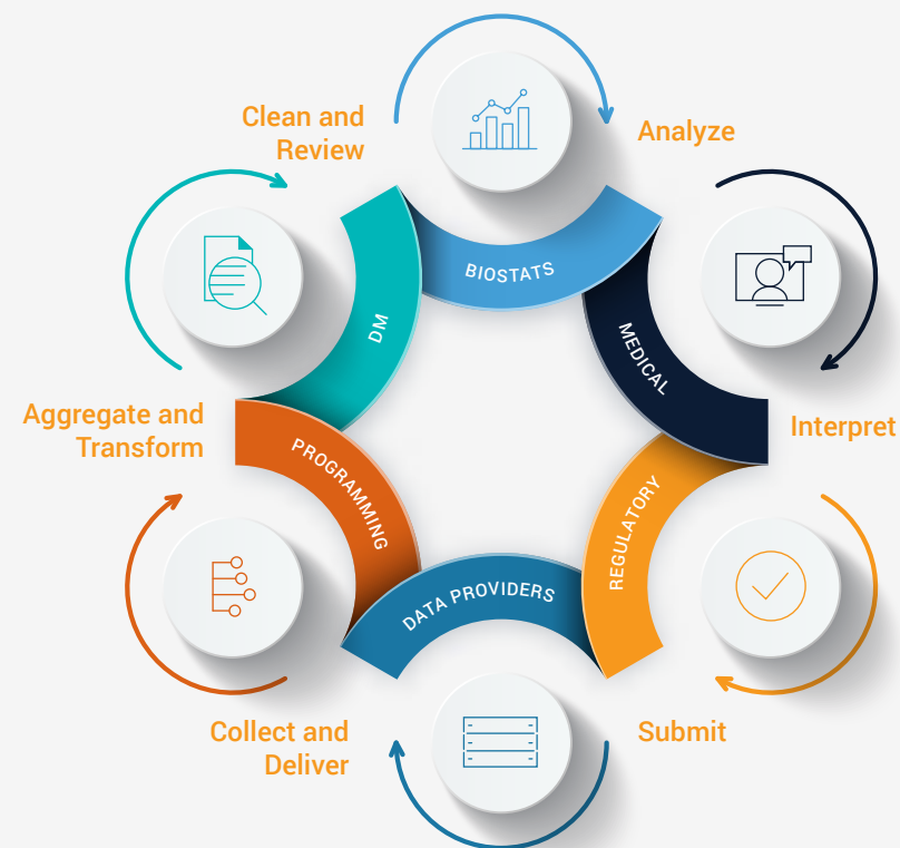
FIGURE 1 Desired Collaboration Using a Clinical Data Workbench

Today, when external patient data predominates, reliance on the wrong tool creates risk and vulnerability. For example, a statistical computing environment may aggregate and transform data well, but won't enable data cleaning; a clinical data repository may aggregate but cannot transform, while a visualization application won't handle aggregation effectively.