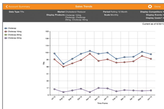
Figure 2: Actionable Insights

Accurate data is at your fingertips with a seamless connection to Veeva CRM's cloud-based database for prescriptions, sales, and customer interaction data.