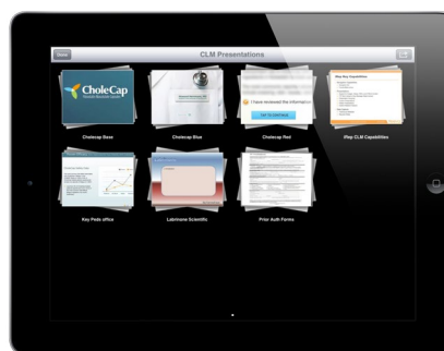
Figure 1: Digital Presentation Library

Veeva CLM is a scalable, closed loop marketing solution that helps your field force create richer face-to-face customer interactions and provides detailed feedback to your marketing and sales teams. Customer data from CRM is seamlessly linked with presentations to deliver personalized content, boosting the impact of each customer engagement.