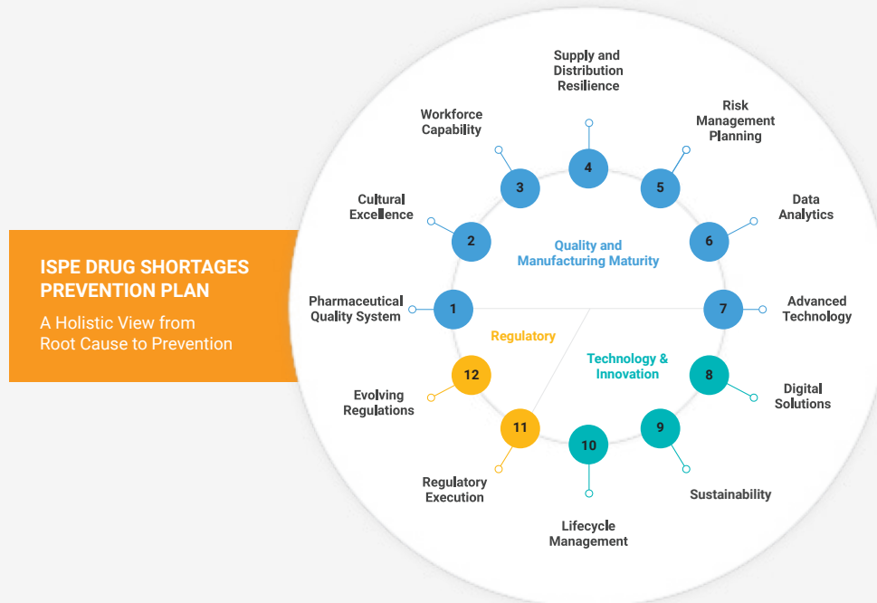
FIGURE 1. PREVENTING DRUG SHORTAGES: BEST PRACTICES ACROSS FUNCTIONS

European regulators launched similar efforts in 2016 and issued guidance 6 in 2023. Its goal is to help marketing authorization holders, wholesalers, distributors, and manufacturers optimize their response to drug shortages resulting from GMP noncompliance. It also includes best practices learned during the COVID-19 pandemic.